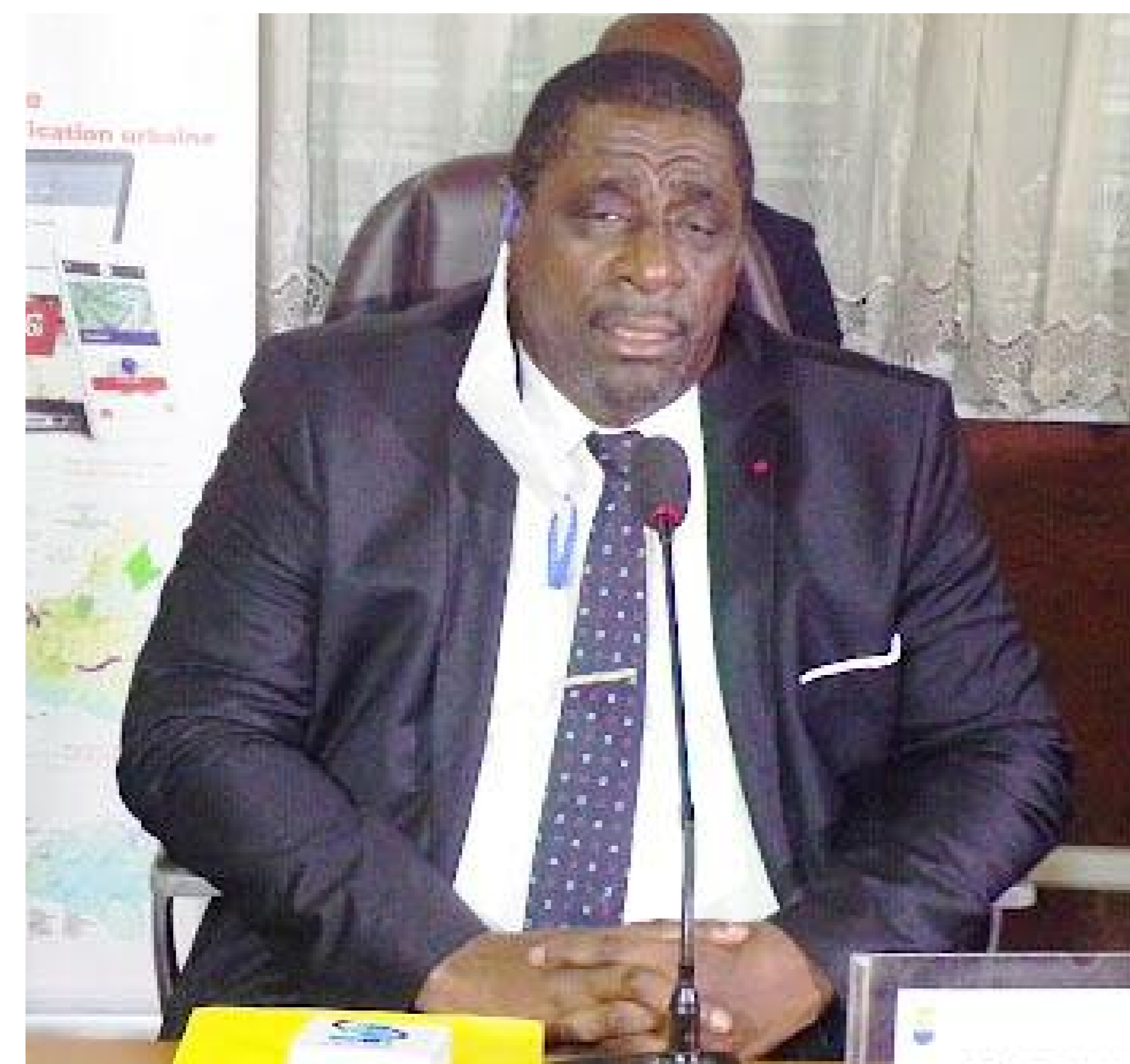
Roger Mbassa Ndine: City mayor of Douala

To restore the soundness of the advertising industry in Douala, officials are also said to have disclosed that the said consulting firm implemented several strategies including geo-localizing all the advertising panels around the economic capital, as well as dematerializing the control and monitoring of advertising operations. In January 2021, a local advertising law became effective in Douala, which thus became the first Francophone Sub-Saharan African city to take such initiative.