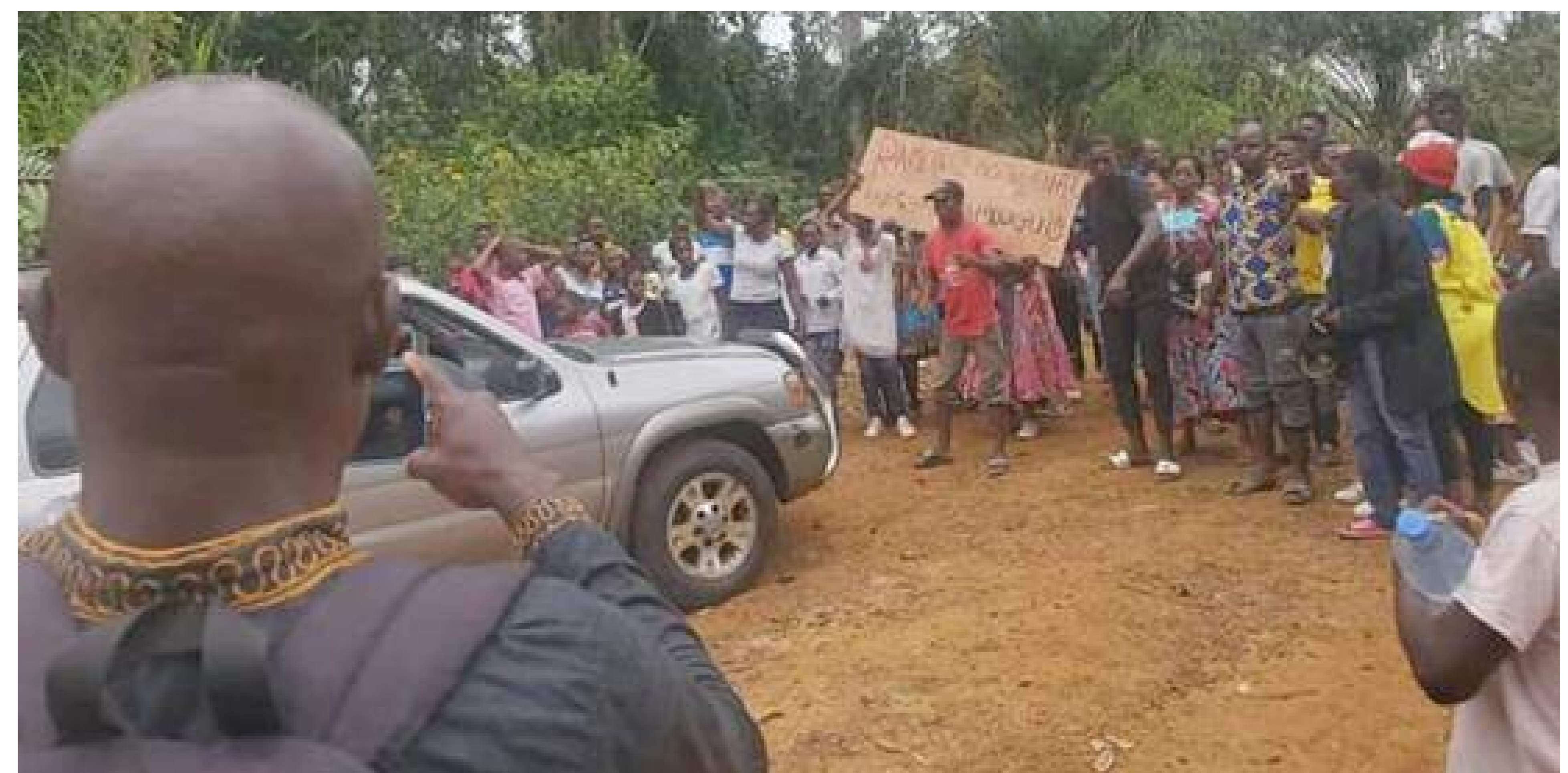
Sts Philippe & Jacques Parish Christians staging the protest Sunday

He stated that the priest's actions "created a scandal and confusion". He therefore stopped the priest from carrying out