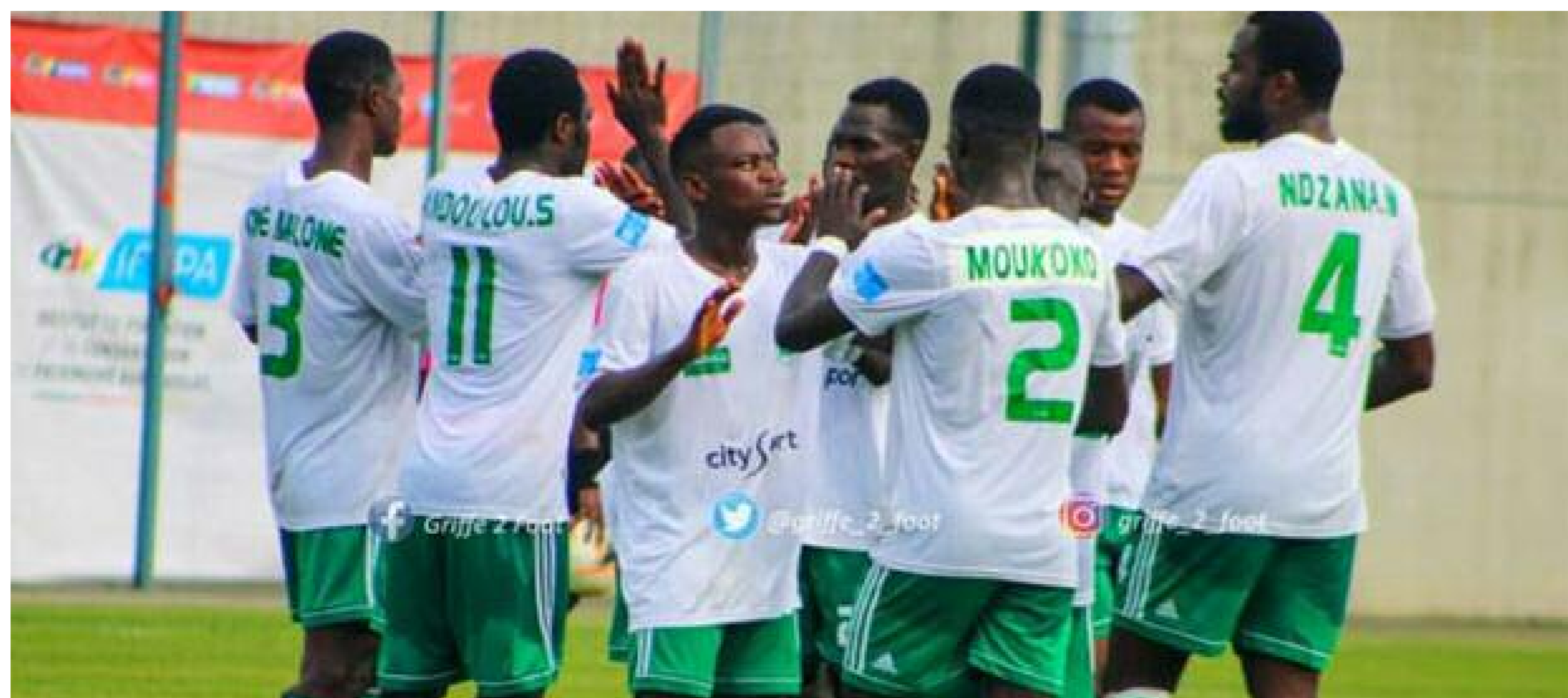
Union Douala: relegated for first time in over half a century

The team finished 10th on the 11-club Pool A of the top tier championship, ending the season 1 point