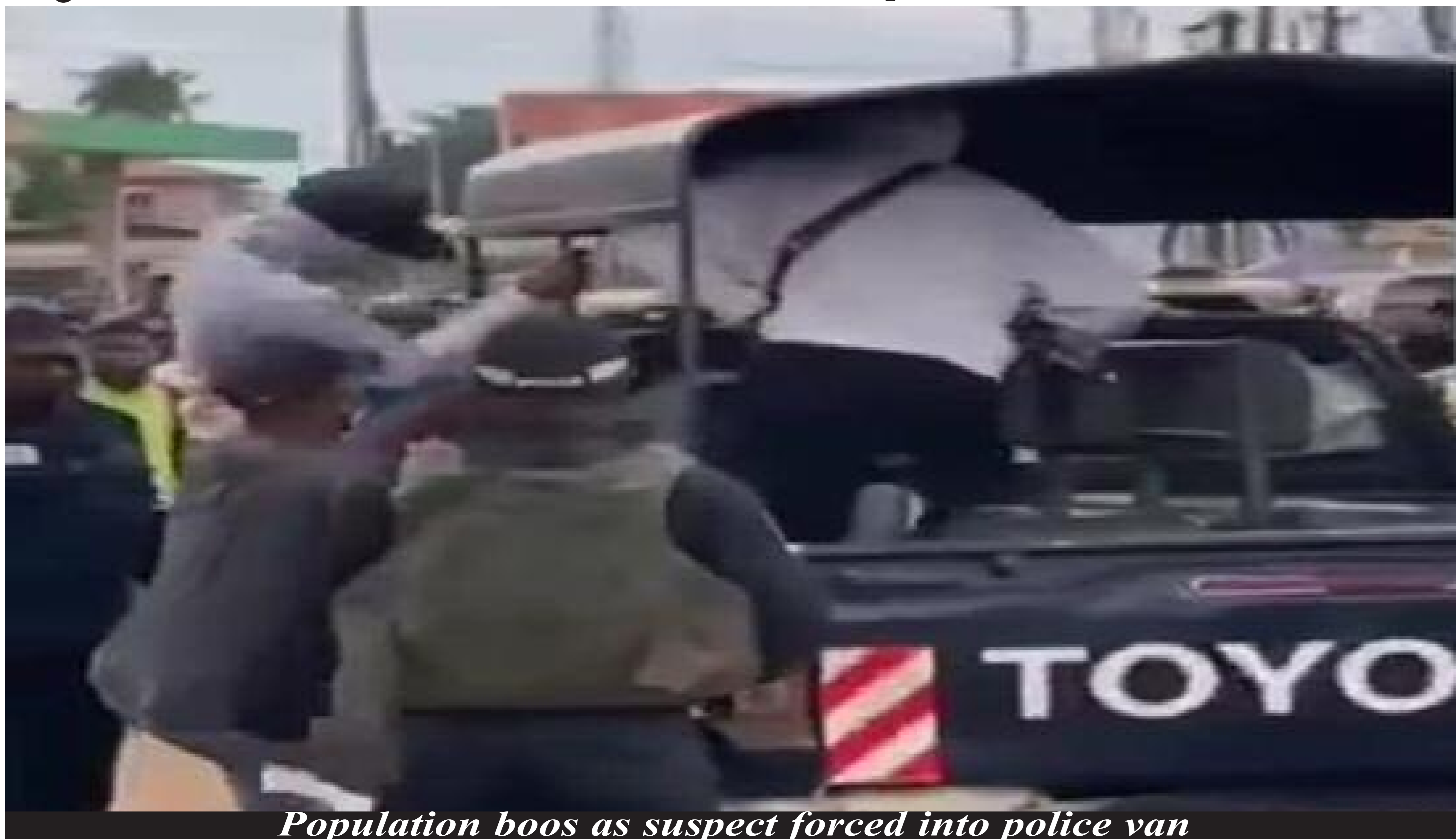
Population boos as suspect forced into police van