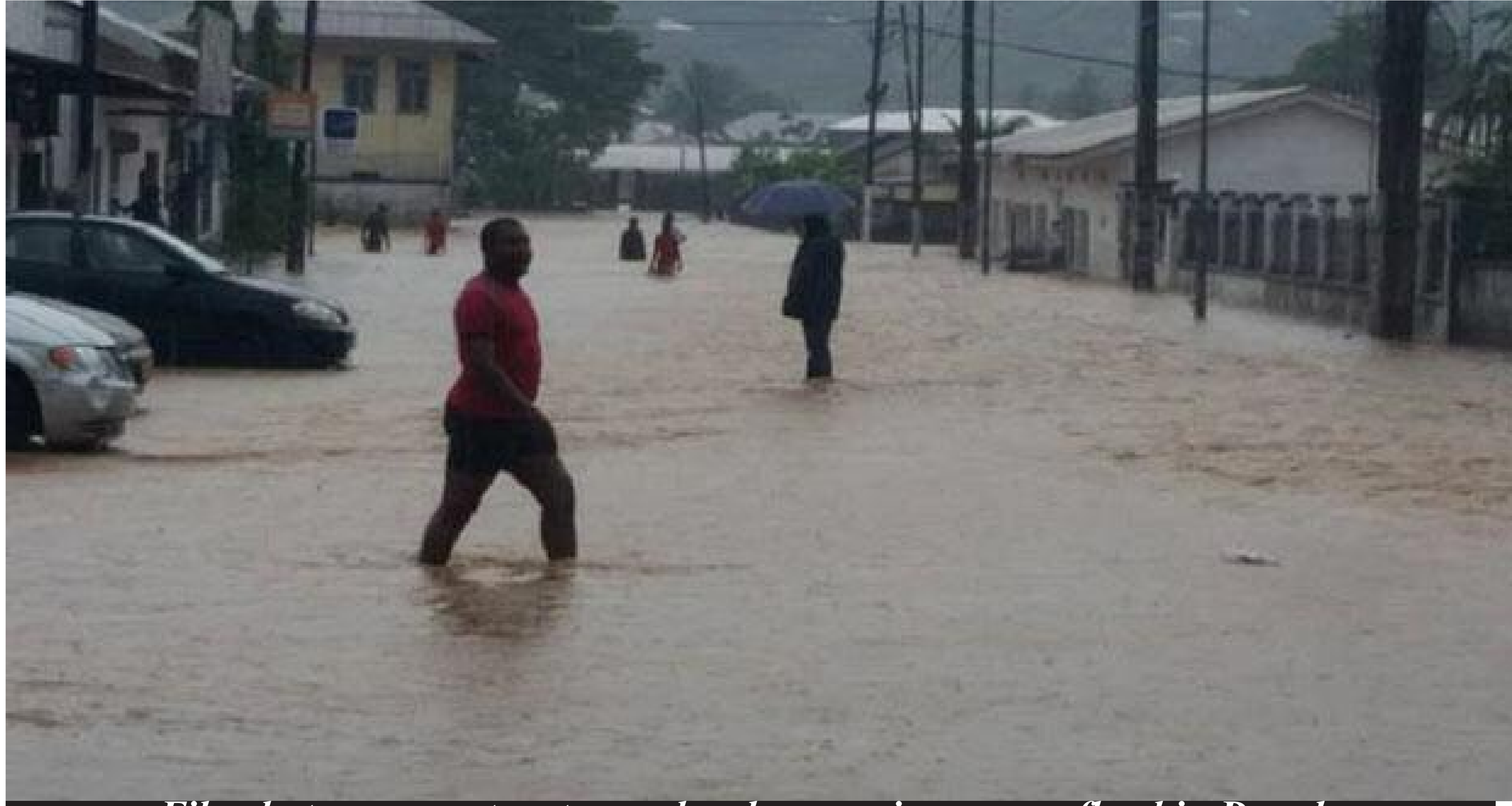
File photo: commuters trapped as heavy rains causes flood in Douala