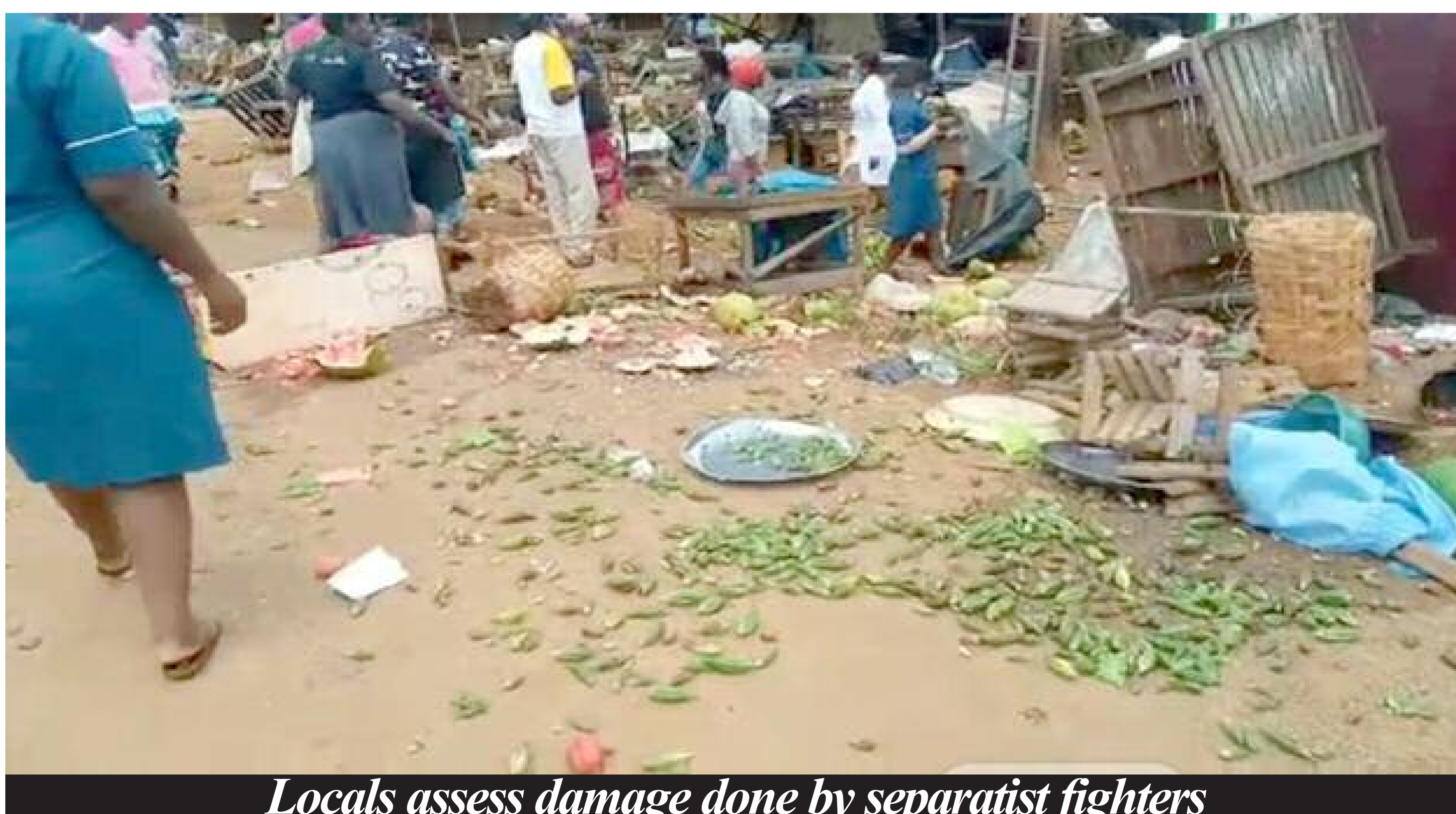
Locals assess damage done by separatist fighters

The recent incidents come just days to the 2021/2022 academic year. Authorities have urged parents in the crisis-hit regions to continue to brave the odds and send their kids to school, to secure a brighter future for them.