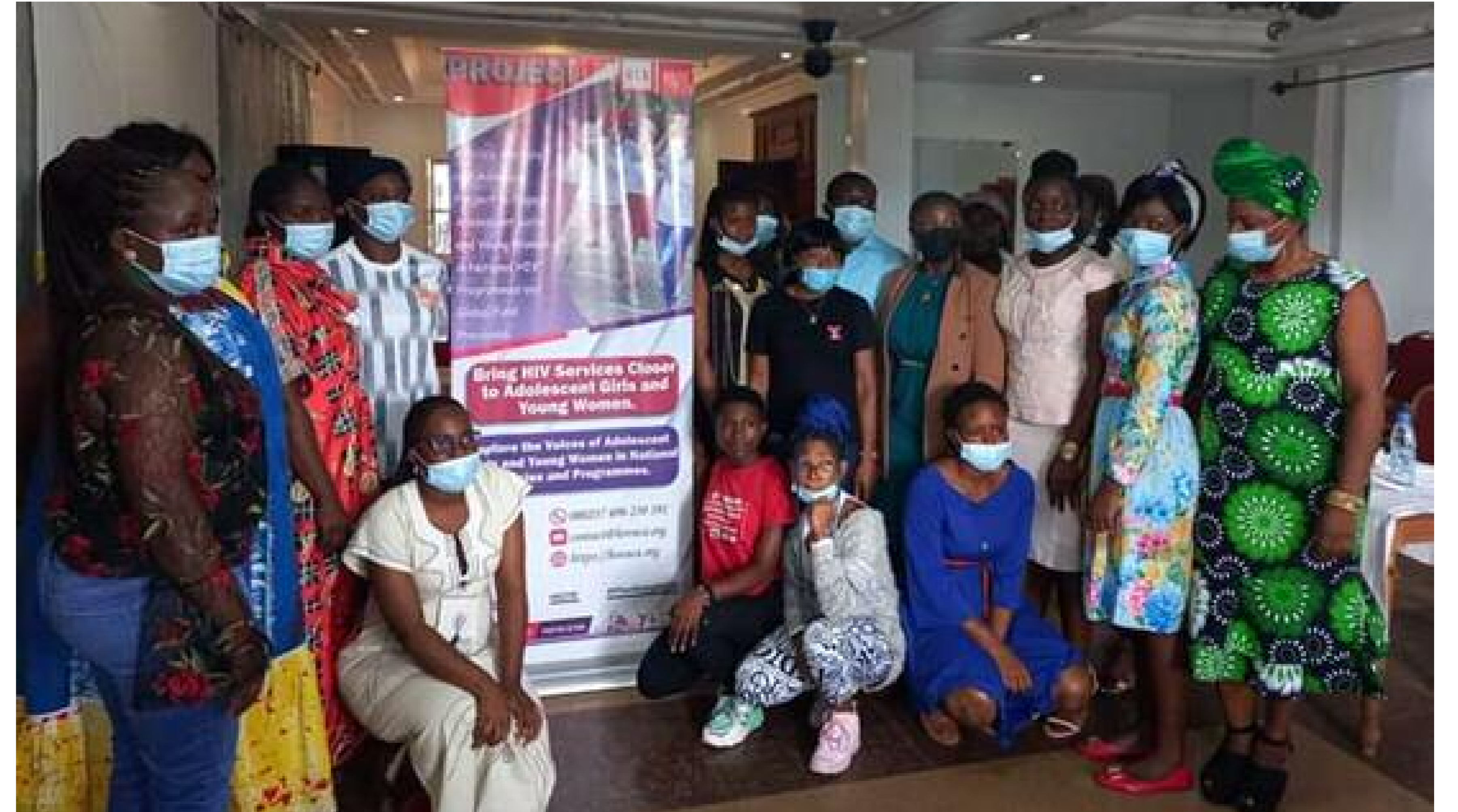
Organisers, officials, adolescent girls in group photo after press conference

"Some of the problems that we face are stigmatisation and discrimination,