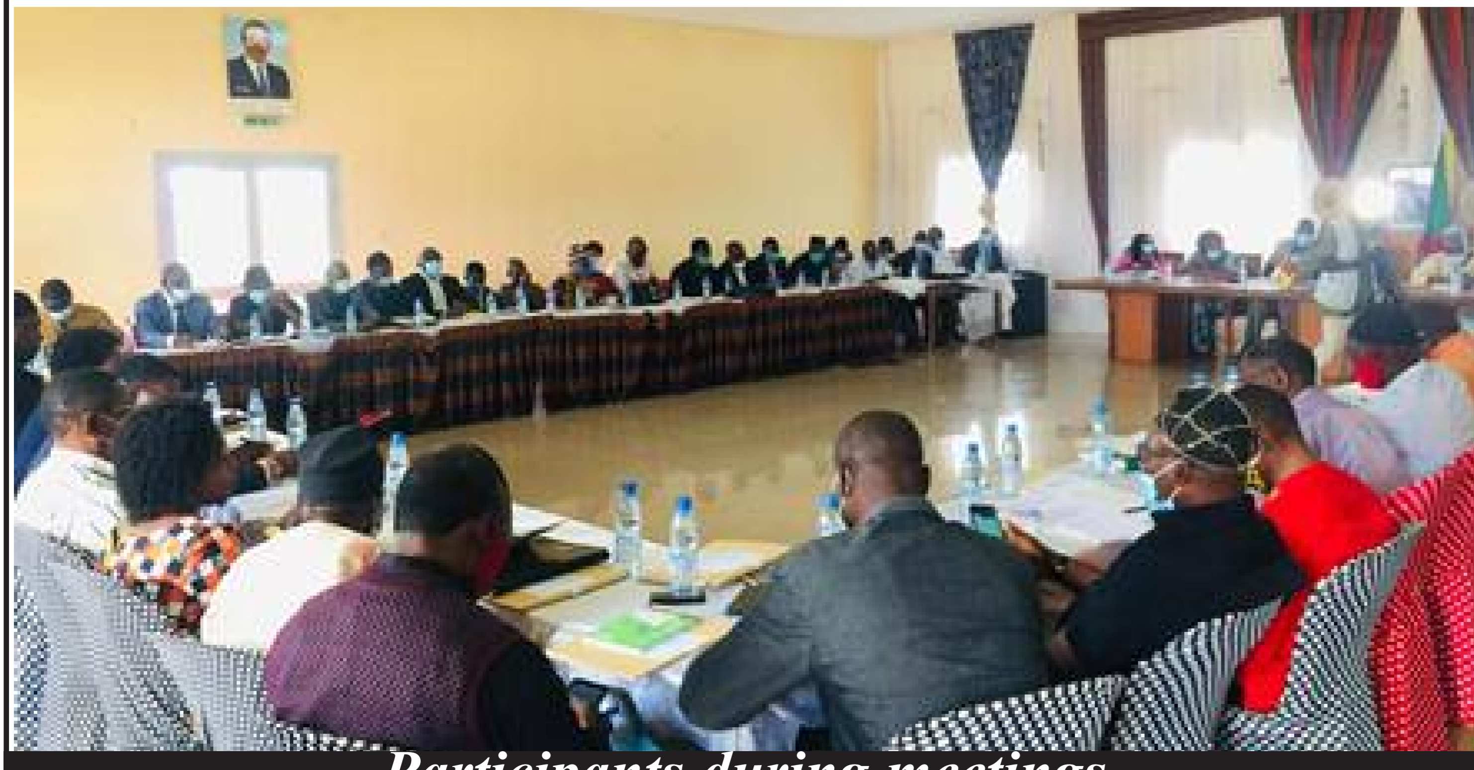
Participants during meetings