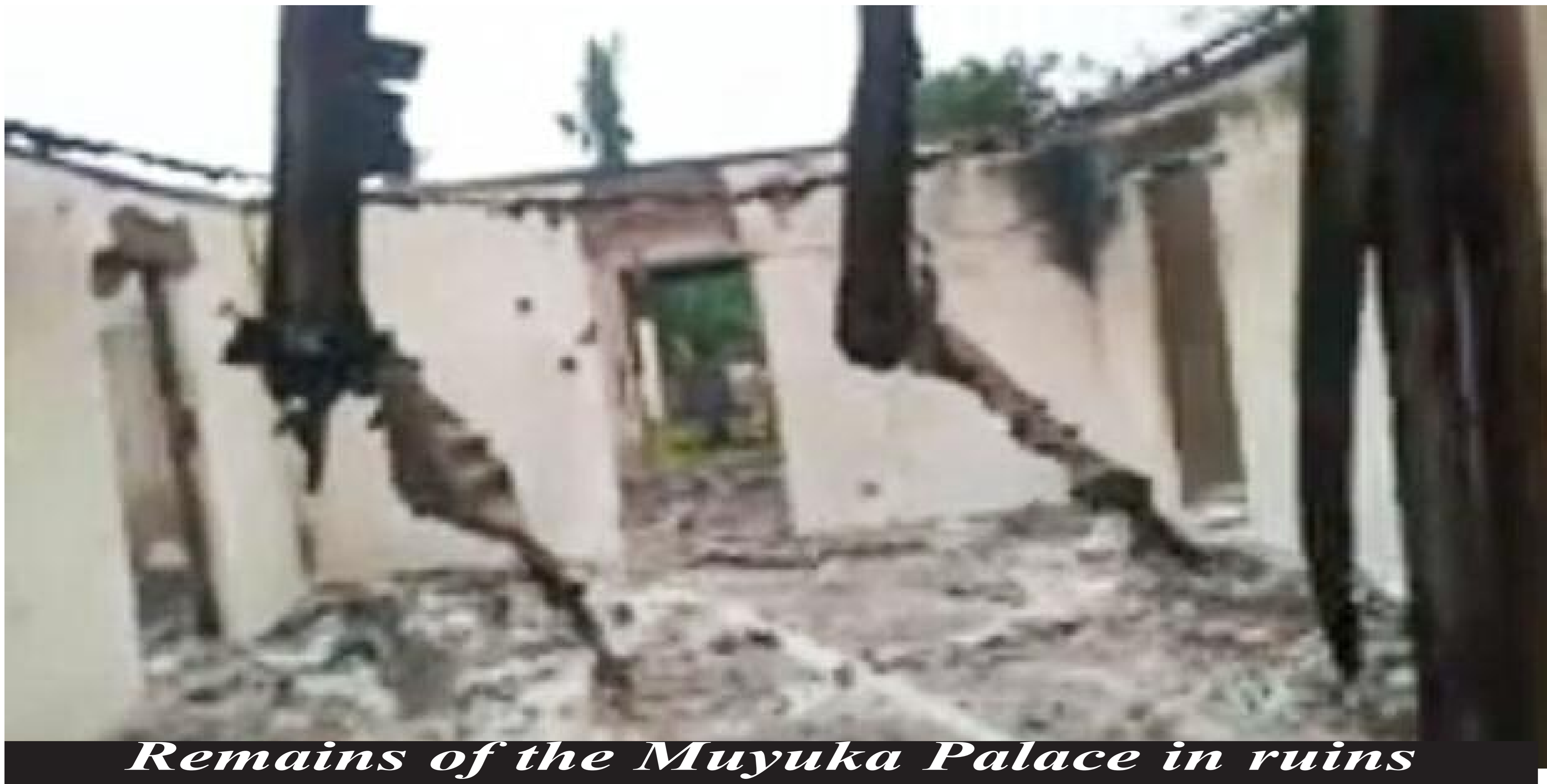
Remains of the Muyuka Palace in ruins

According to UN agencies, thousands of Cameroonians have been displaced out of the two regions due to the crisis.