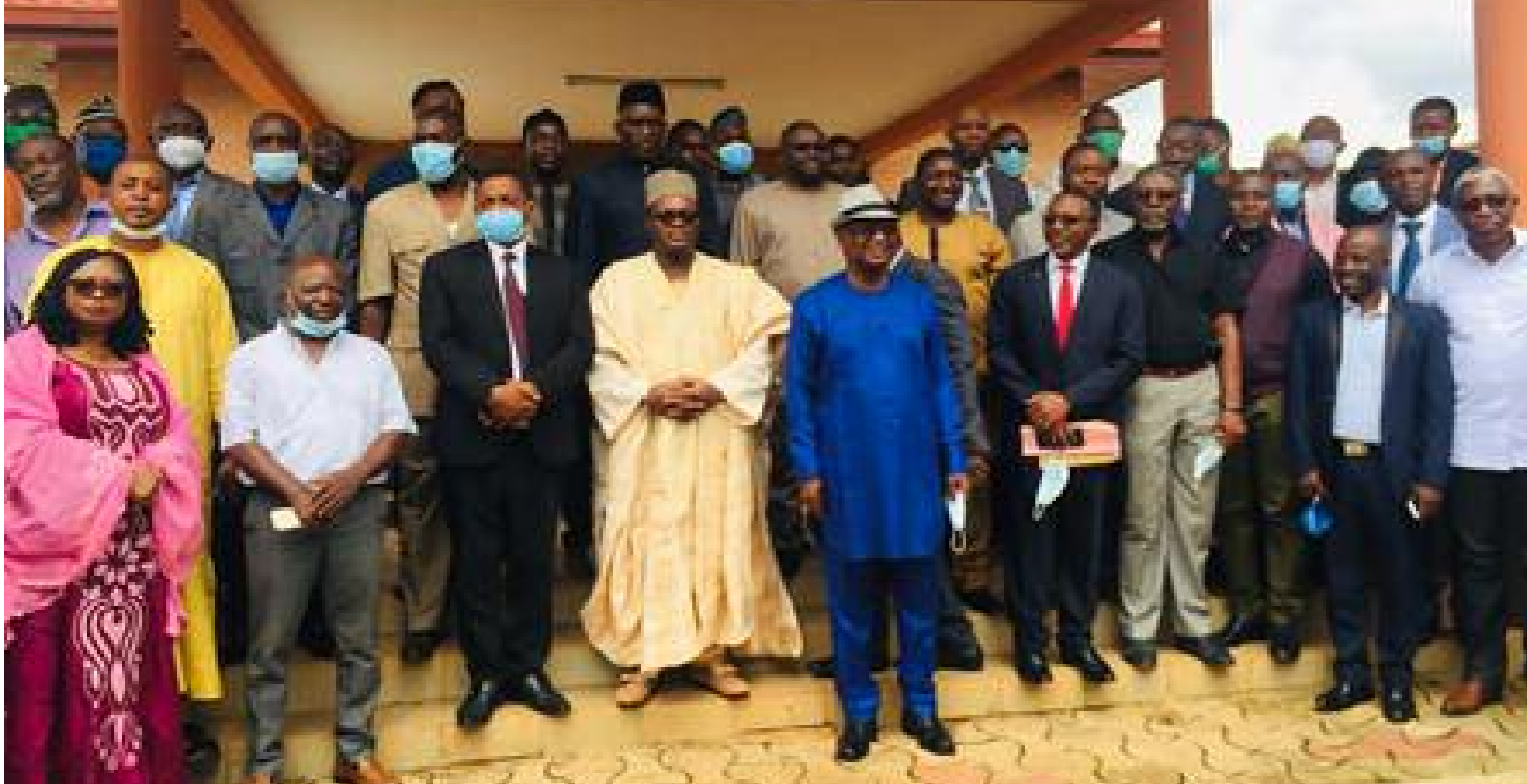
Regional Assembly officials, education stakeholders in group picture

Members of the North West Regional Assembly and education stakeholders have combined efforts to ensure effective school in the region for the 2021/2022 academic year. They have made a call for all in the region to contribute towards ensuring a hitch-free school year.