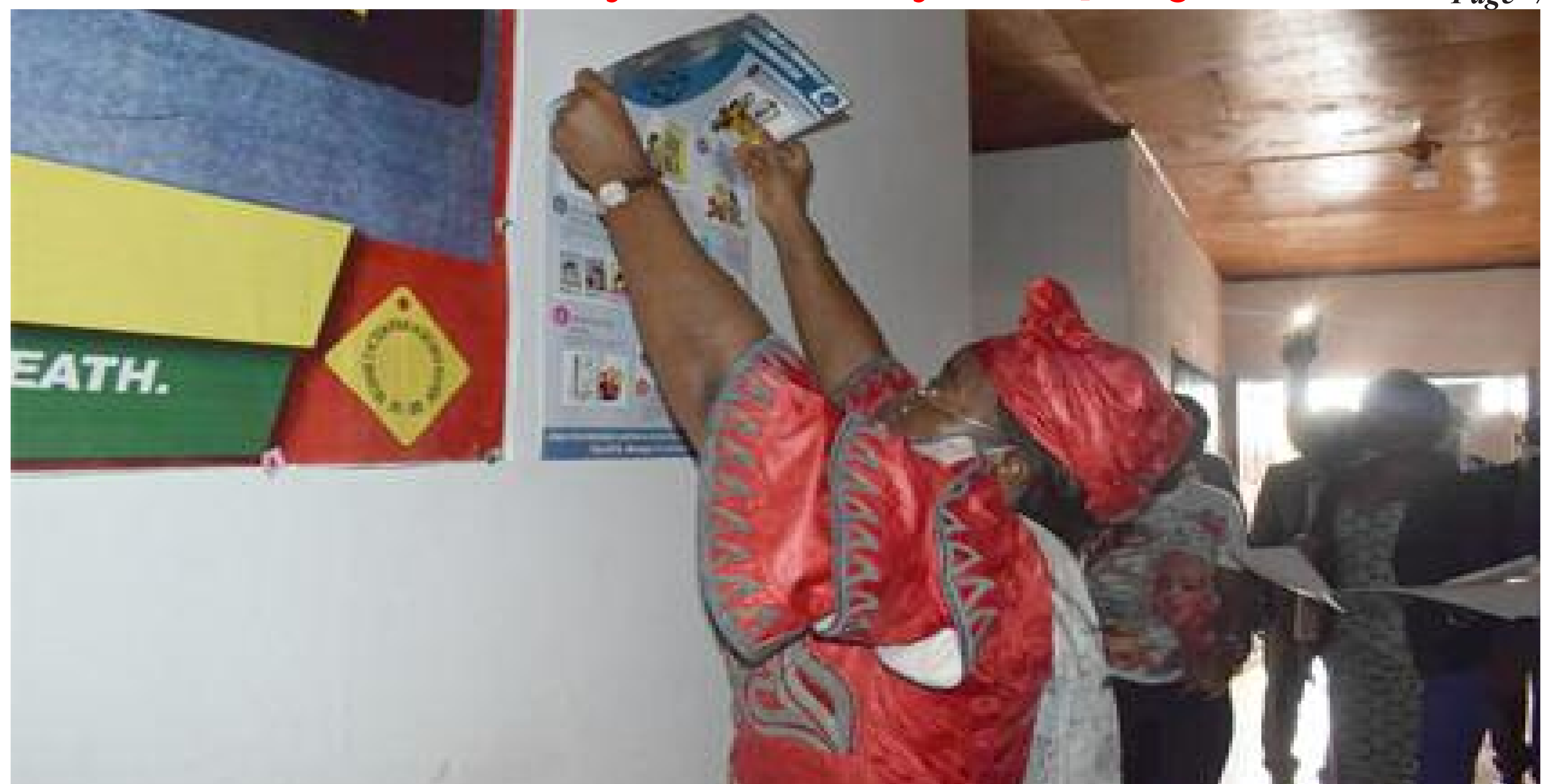
Minister Minette Libom Li Likeng personally affixing cybersecurity campaign poster in Bertoua