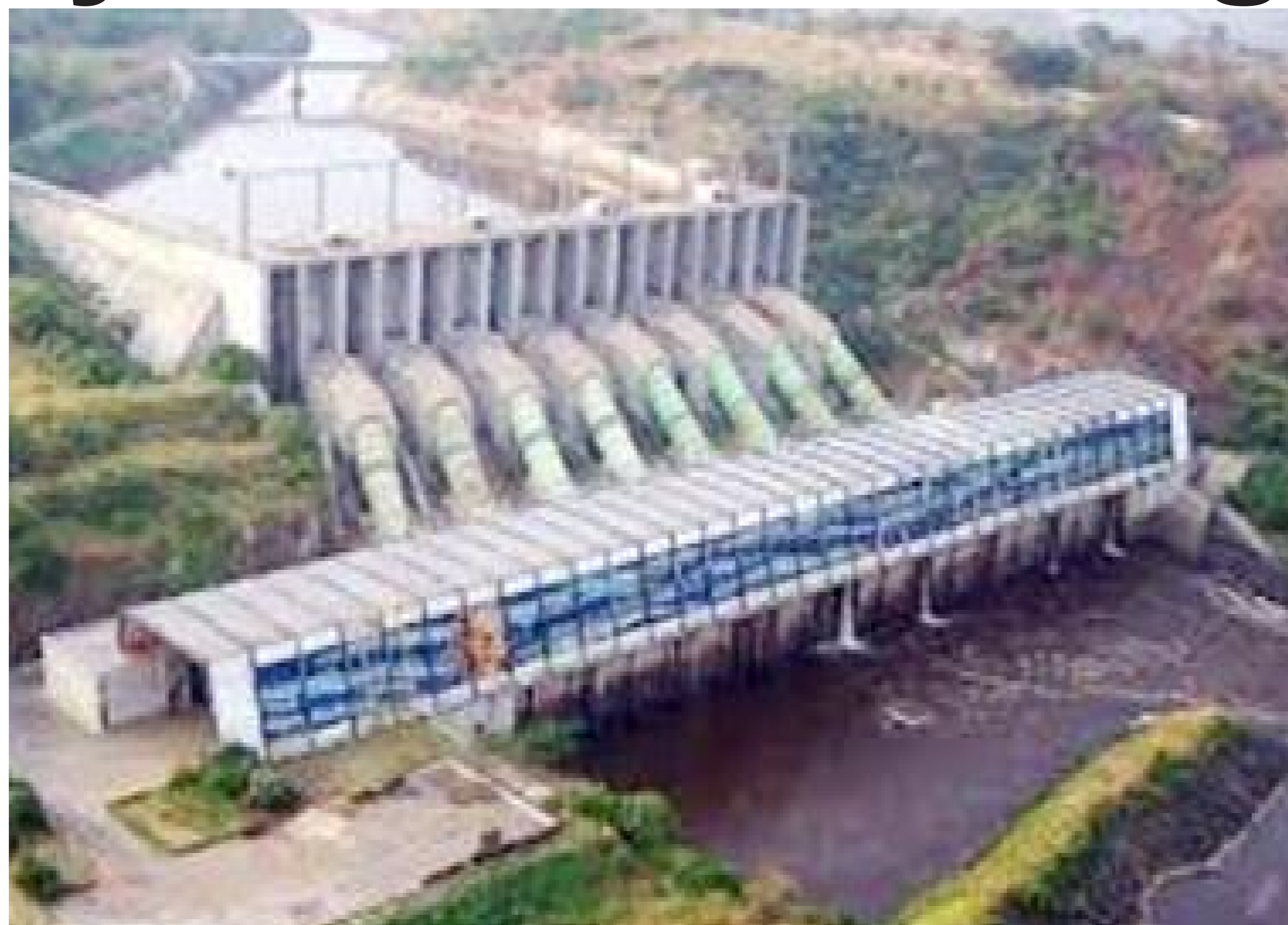
Memve'ele hydroelectric dam