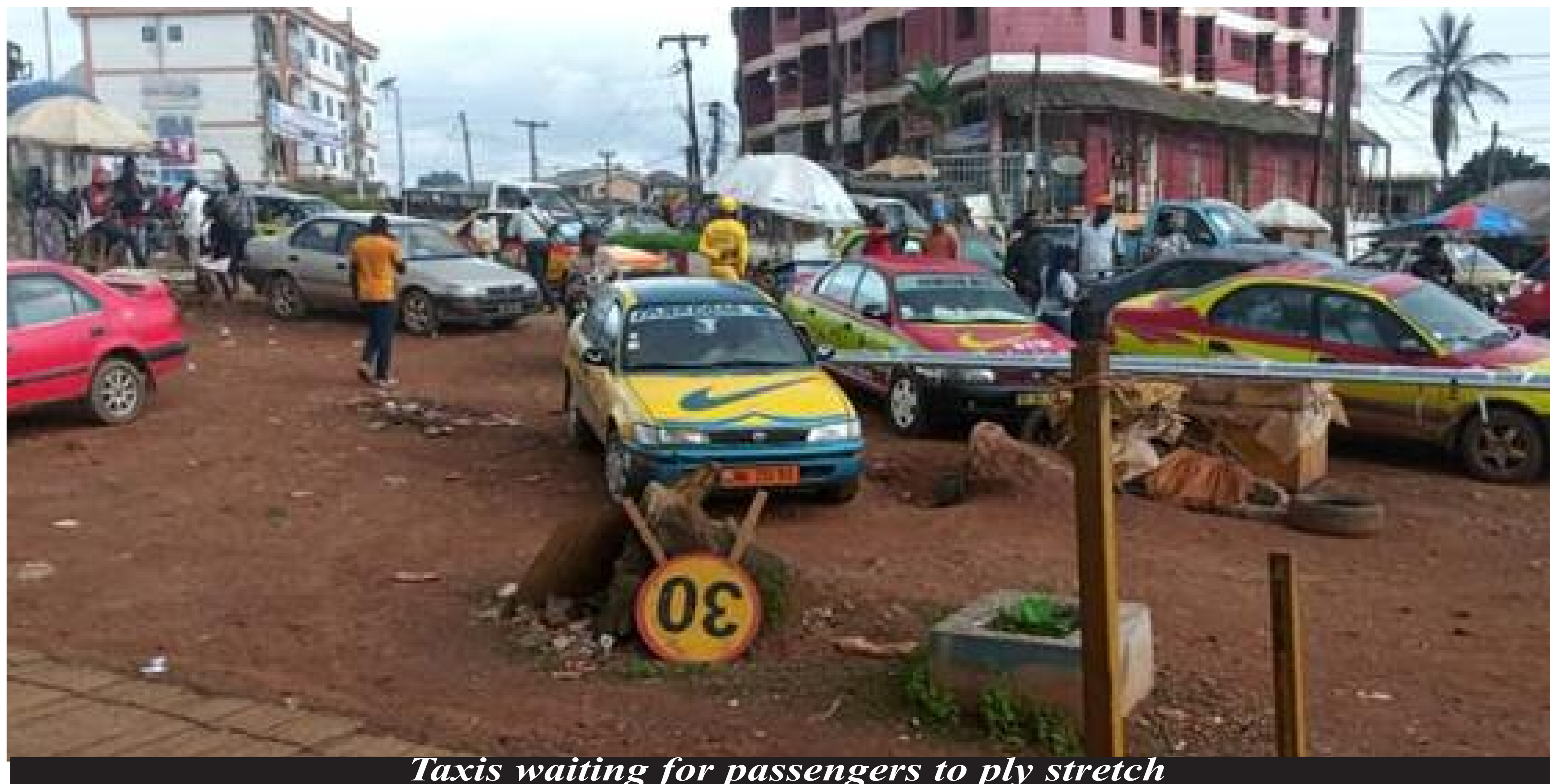
Taxis waiting for passengers to ply stretch

According to some of the drivers interviewed, the security forces collect money from them daily even during