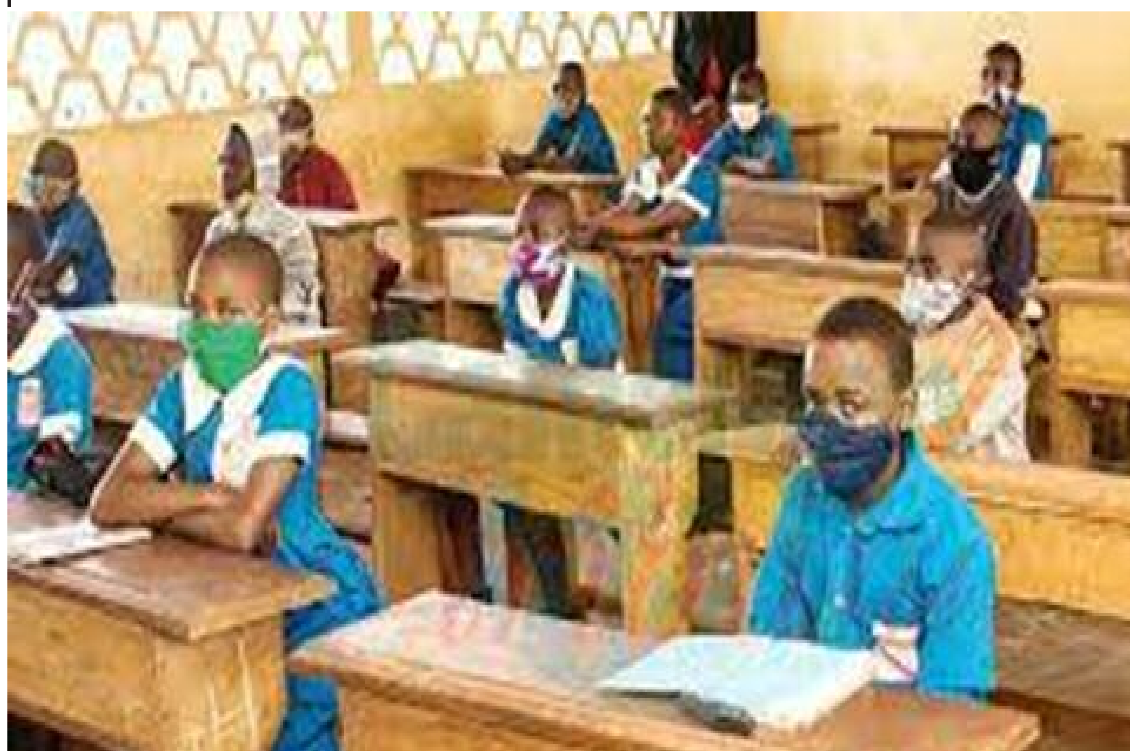
File photo: Pupils taking lessons in a classroom

The Education Reform Support Project seeks to improve equitable access to quality Basic Education. The project also seeks to improve school effectiveness through performance-based financing among others.