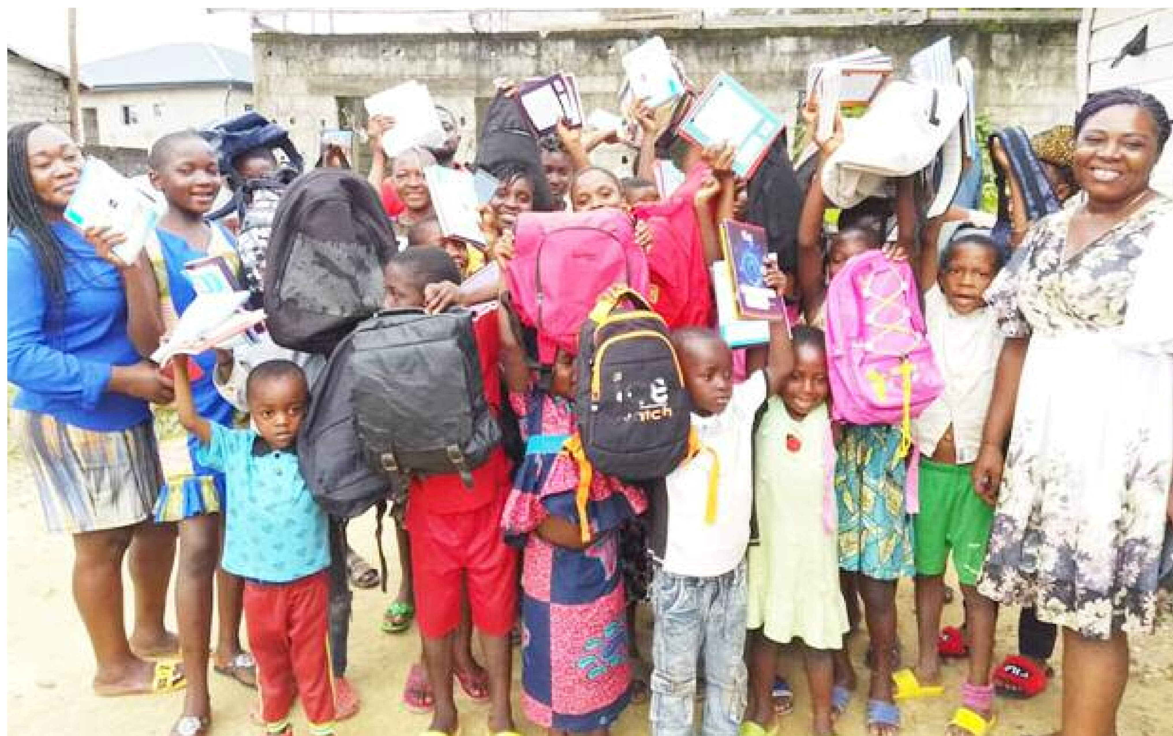
CAMASEJ president and Members with IDPs in Kuwait-Douala

"...the association plans to extend similar help not only to distress internally displaced children in Douala but also to families who cannot meet up financially with the needs of their children, and also