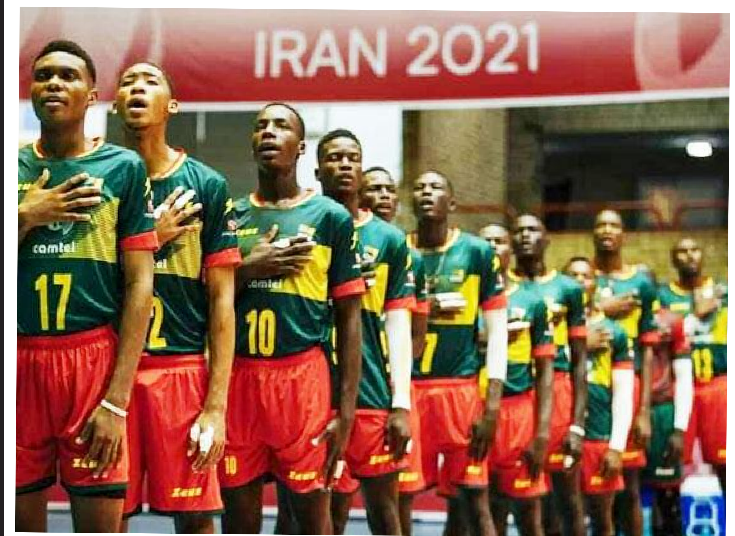
Cameroon U-19 boys volleyball Lions

Cameroon U-19 boys national volleyball selection that travelled to Iran for the 2021 U-19 Boys' World Volleyball Championship are set to return home without winning a single match in the global event.