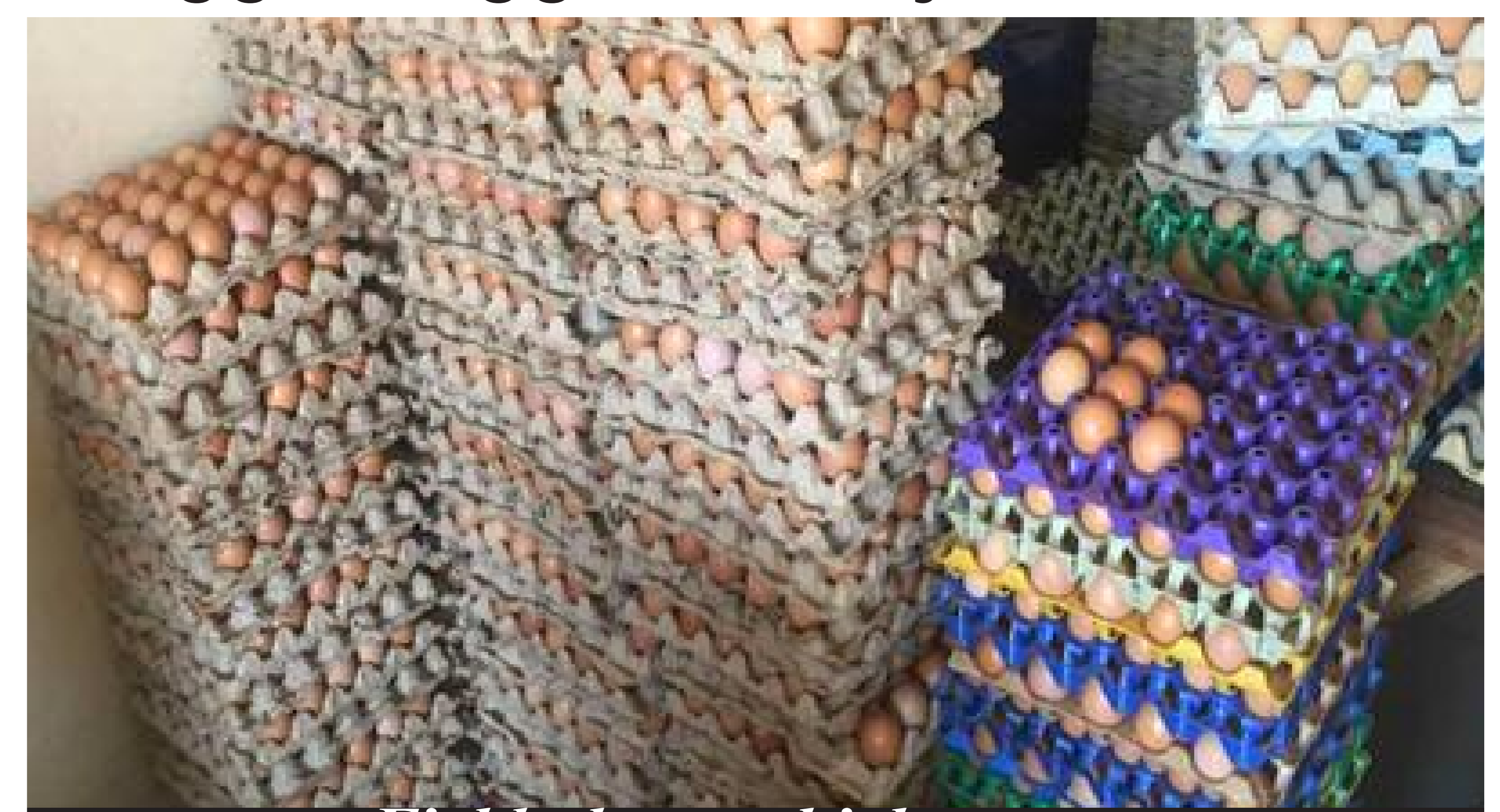
Field photo: chicken eggs

The importer of the eggs, it was reported, had importation authorisation and failed to present other required documents 72 hours before importation at the