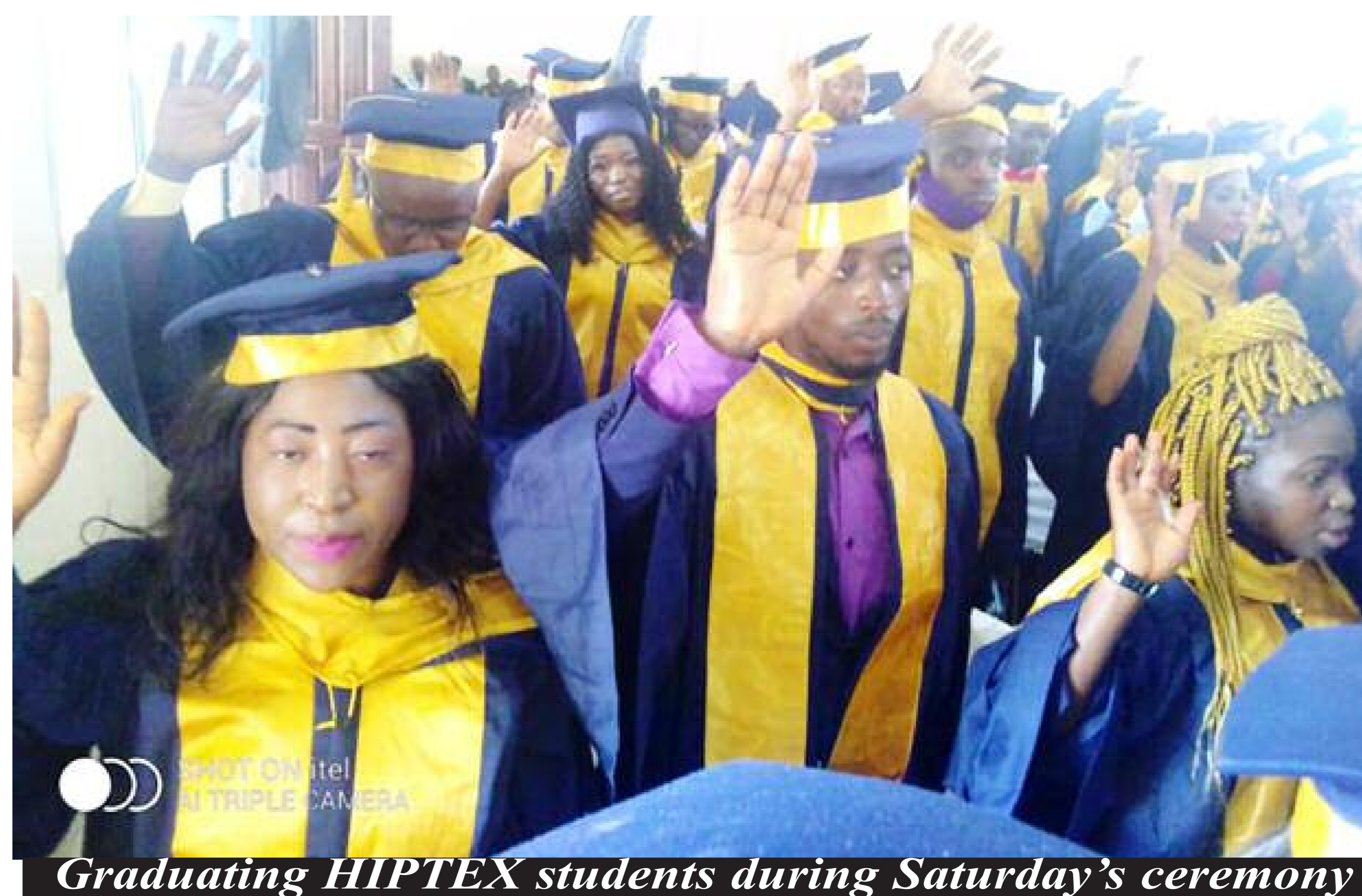
Graduating HIPTEx students during Saturday's ceremony

He said "At HIPTEx, we train students not only in theory but the practical aspect of it. That is why out of eight students in the whole