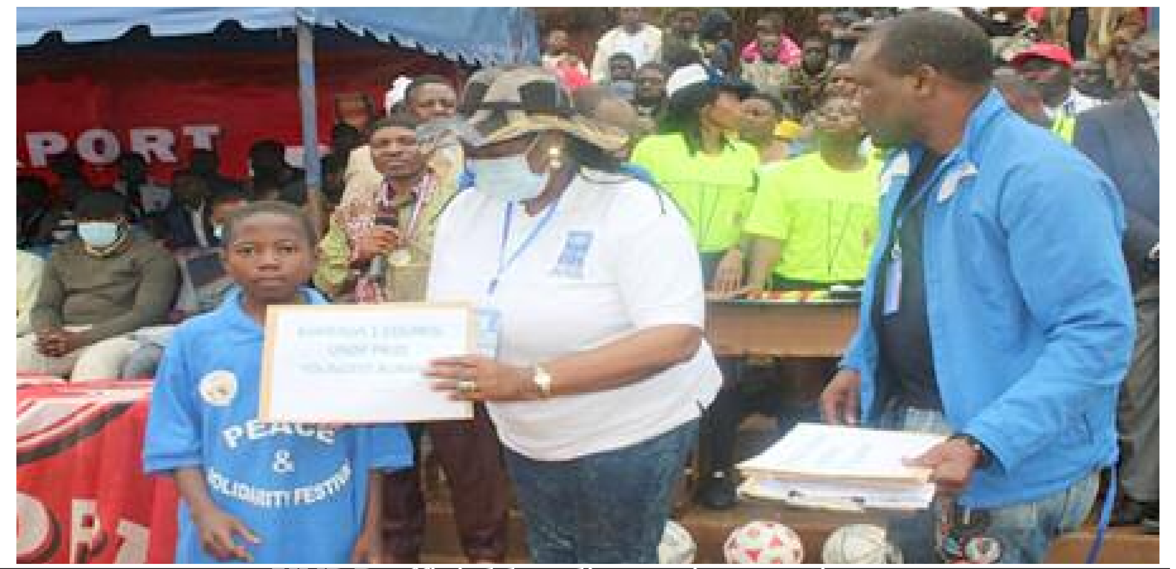
UNDP official handing prize to winner